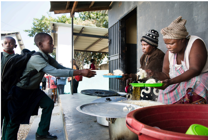
Children queue for lunch at a school in Lusaka.

Zambia continued to grapple with the aftermath of its most severe drought in four decades. A five-week drought during last year's rainy season led to crop failures and water shortages, creating food insecurity throughout the year.