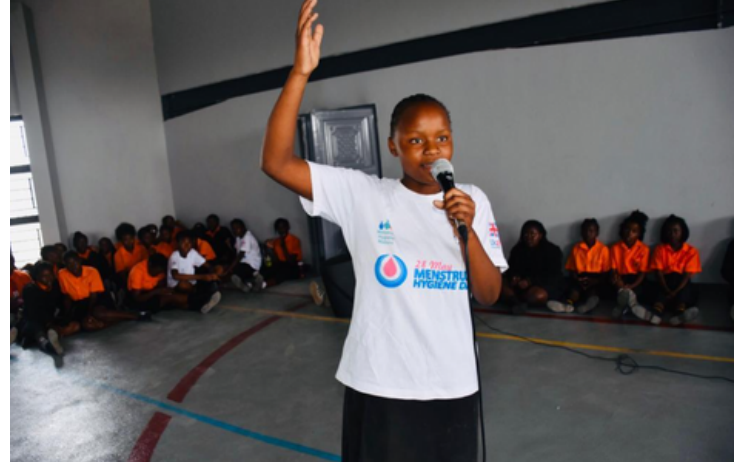
Sensitization taking place at Hope & Faith School in Lusaka

The progress made by our pilot was incredible. 68% knew their HIV status. Students were 42% more likely to identify sexual harassment.