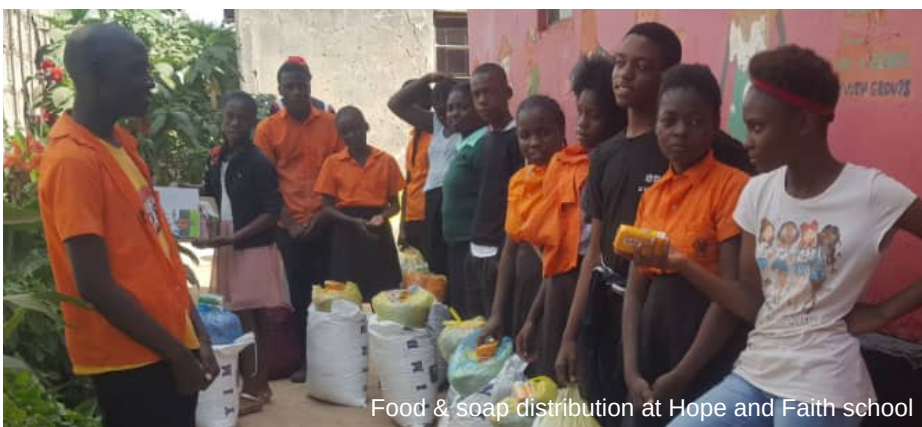
Food & soap distribution at Hope and Faith school

Thank you for all your donations that made this possible.