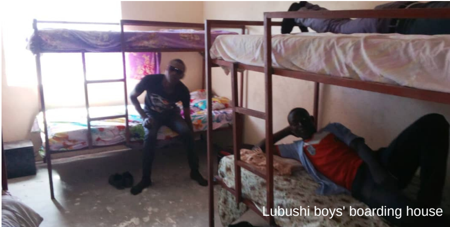
Lubushi boys' boarding house

If you keep the boys safe, you keep the girls safe. That's part of our thinking for building the boarding house for boys at Lubushi in Northern Province. We're excited to announce that it is finished and 64 boys have moved in!