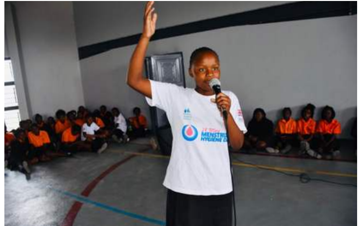
Sensitization taking place at Hope & Faith School in Lusaka

The progress made by our pilot was incredible. 68% knew their HIV status. Students were 42% more likely to identify sexual harassment.