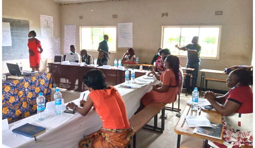
Psychosocial training taking place in Chibolya

of mental health issues and then proceeded to teach them about Psychosocial Counselling and how to implement it effectively. This included sections on ethics, child abuse, and HIV/AIDS. Participants demonstrating a 54% increase in knowledge after the training and are now equipped with the necessary skills to improve students' well-being by providing counselling to vulnerable students.