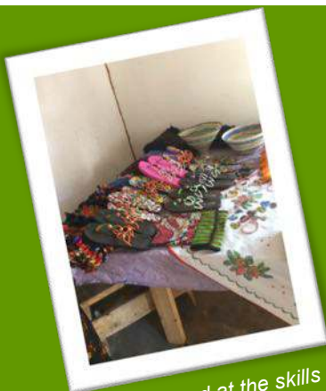
Items produced at the skills training centre at Hope & Faith School.

By early secondary school girls in Zambia are dropping out 3X faster than boys, leaving them lacking the skills and resources to support themselves. The reasons are varied but include lack of funds, abuse, early marriage and low self-esteem and aspirations. Equal access to education is crucial for Zambia’s development and ZOA-UK is committed to help tackle some of these issues and open up education for girls by funding additional social support and community engagement.