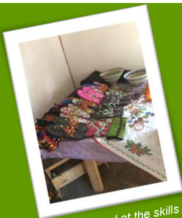
Items produced at the skills training centre at Hope & Faith School.

By early secondary school girls in Zambia are dropping out 3X faster than boys, leaving them lacking the skills and resources to support themselves. The reasons are varied but include lack of funds, abuse, early marriage and low self-esteem and aspirations. Equal access to education is crucial for Zambia’s development and ZOA-UK is committed to help tackle some of these issues and open up education for girls by funding additional social support and community engagement.